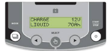
Intuitive interface available in 22 languages